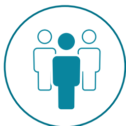
TOTAL STAFF IN POST