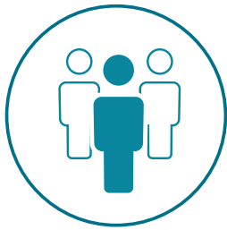
CLINICAL STAFF IN POST