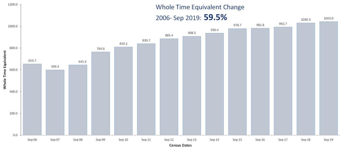
Figure 1: Trend illustrating Whole Time Equivalent of CAMHS staff in NHS Scotland from 30 September 2006 to 30 September 2019.